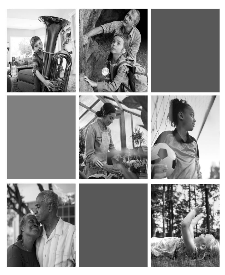
Your Health Care Benefits Program Blue Cross and Blue Shield of Illinois, a Division of Health Care Service Corporation, a Mutual Legal Reserve Company, an Independent Licensee of the Blue Cross and Blue Shield Association